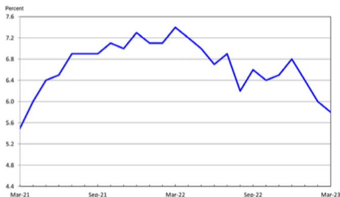
Chart 1. Job openings rate, seasonally adjusted, March 2021 - March 2023

On the last business day of March, the number of job openings decreased to 9.6 million (-384,000) and was 1.6 million lower than in December. The job openings rate was 5.8% in March and was down by 1.0 percentage point since December. In March, job openings decreased in transportation, warehousing, and utilities (-144,000) but increased in educational services (+28,000).